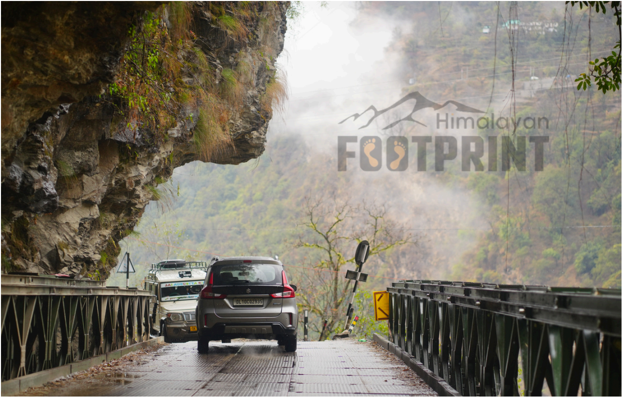
On The Way To Chopta